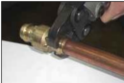
H. Start the pressing process and hold the trigger until the jaw has engaged the fitting.