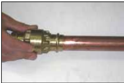
D. Turning slightly, slide press valve on to tubing to the fitting stop. Note: end of tubing must be fully inserted.