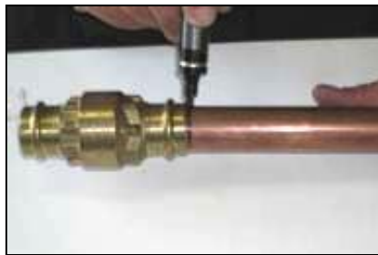
E. Using a marker, draw a line on the tubing where it enters the valve (marking the full insertion depth). Make sure that the arrow on the body is in the direction of flow.