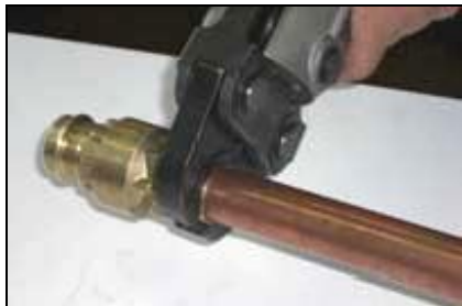
G. Open the jaw and place at right angles on the fitting. Visually check the insertion mark to ensure the tubing has not moved.