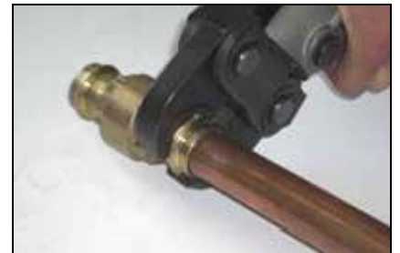
I. After pressing, release the jaws and remove the tool. Do not attempt to adjust the valve on the pipe after pressing.