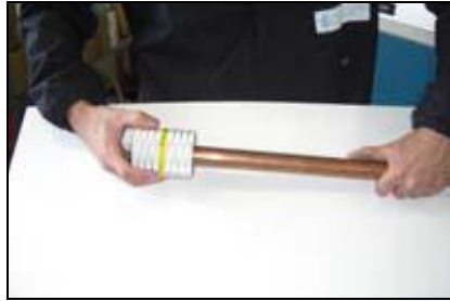
B. De-burr tubing on the inside and outside to prevent cutting of the valve's o-ring seals.