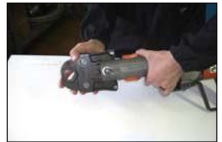
F. Insert the appropriate jaw into the pressing tool and push in holding pin until it locks into place.