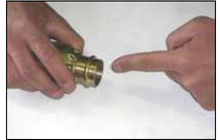
C. Check seal for correct fit. Do not use oils or lubricants. Use only the valve's black EPDM o-ring seals.